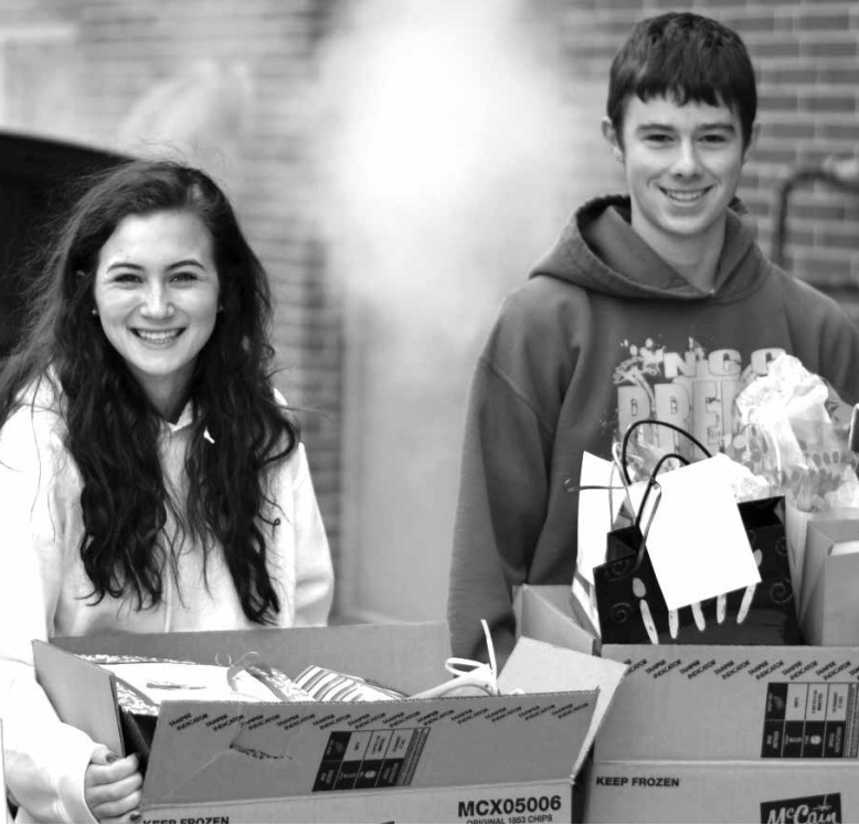
Students from Newport, Kentucky's Central Catholic High School take part in a food drive. Pope Francis has stressed both charity and justice for the poor.

commitment to the poor? As a student of liberation theology, I found it all very thrilling. All the more so to read in Evangelii Gaudium that the biblical message of “mercy to the oppressed” “is so clear and direct, so simple and eloquent, that no ecclesial interpretation has the right to relativize it” ( Evangelii , sec. 194). Pope Francis bluntly rejects “the absolute autonomy of the markets” and Adam Smith’s “invisible hand” and calls upon Christians to live in solidarity with the poor, which he defines as “more than a few sporadic acts of generosity. It presumes the creation of a new mindset which thinks in terms of community and the priority of the life of all over the appropriation of goods by a few” ( Evangelii , sec. 202, 204, 188).