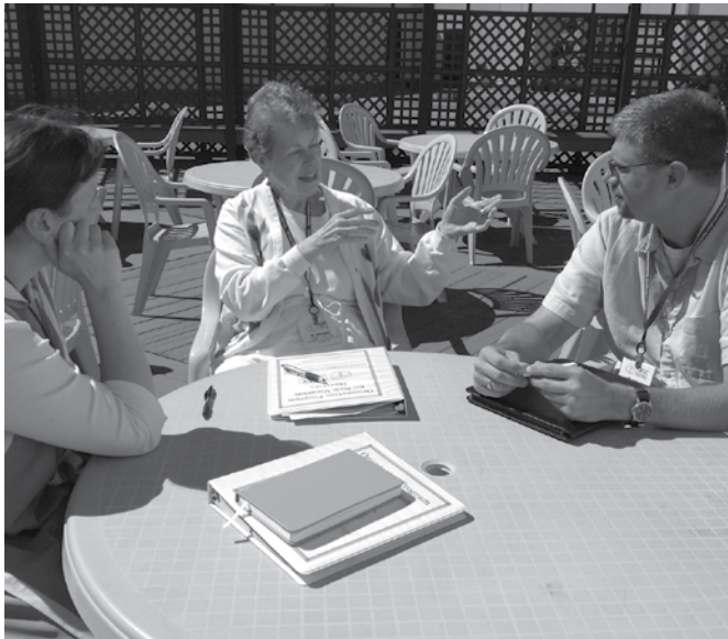
Summer Institute 2014 participants engage in a small group discussion.