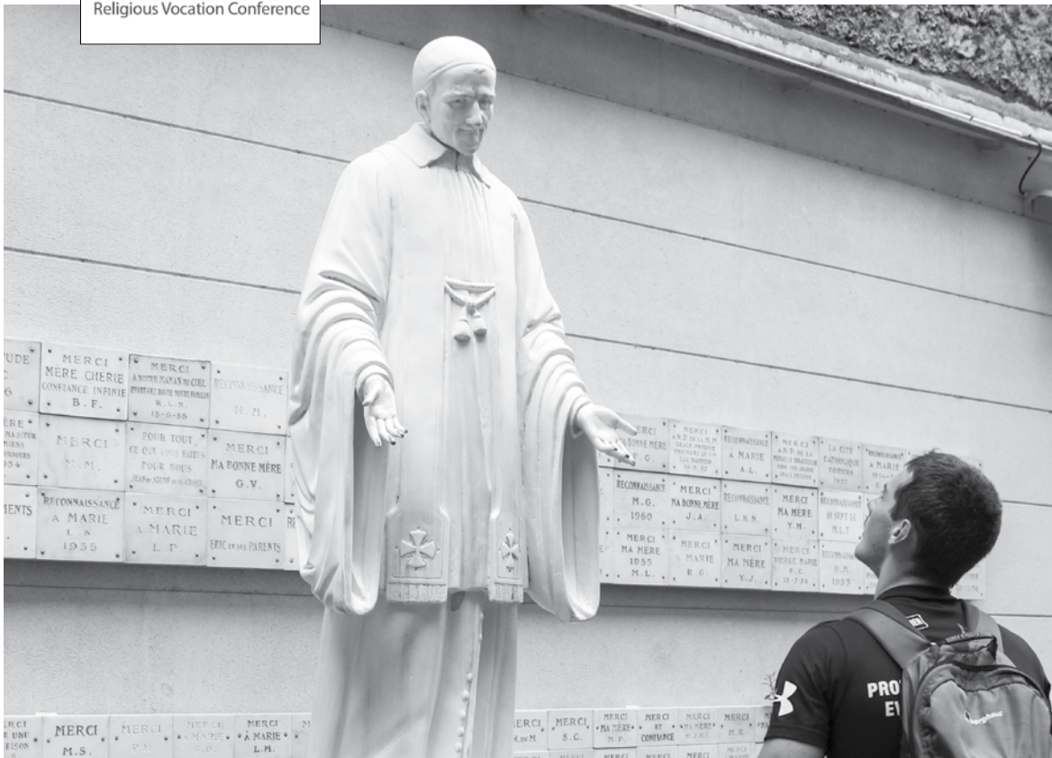
A young man contemplates a statue of St. Vincent de Paul, founder of the Vincentians and, with Louise de Marrillac, the Daughters of Charity.