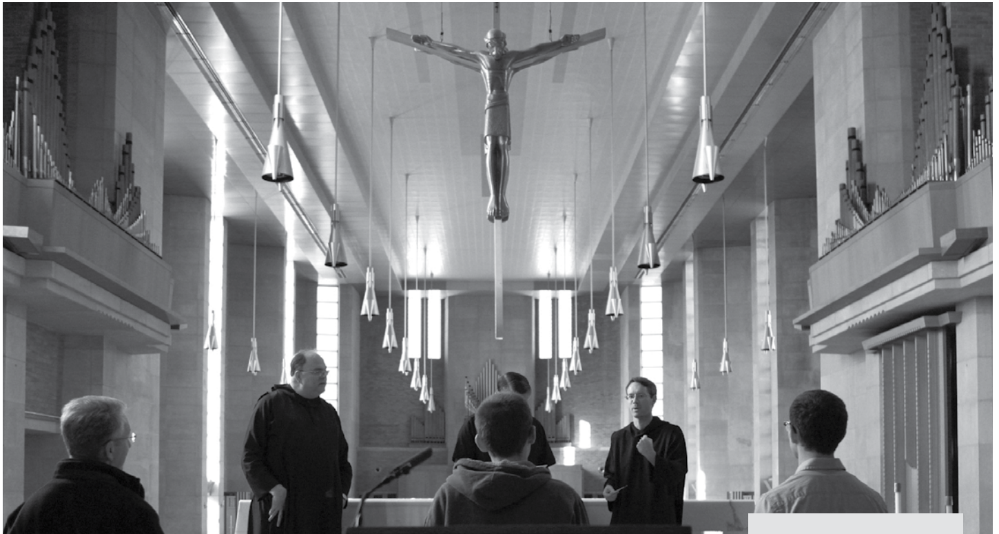
Can religious communities rise to the challenges that Pope Francis is presenting to them? The monks of St. Benedict Abbey in Atchison, Kansas prepare for a liturgy.