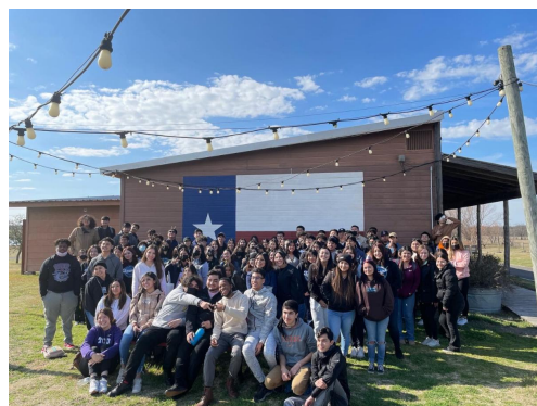
The CRD Class of 2022 are all smiles as they

Tears, laughter, good food, inspiring words, crummy weather (!) and heartfelt prayers were all a part of the Cristo Rey Dallas (CRD) Senior Retreat. I was privileged to participate in the retreat which took place March 6-9 at Sabine Creek Ranch in Royse City, Texas, about 40 minutes outside of Dallas.