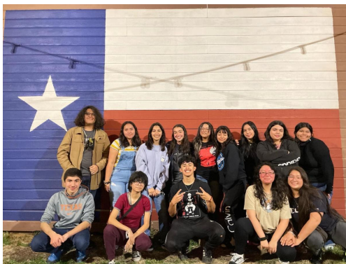
CRD retreat leaders after a job well-done.