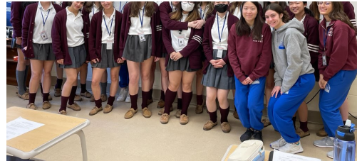
AHA students gather for a group picture following classroom SSND presentations.