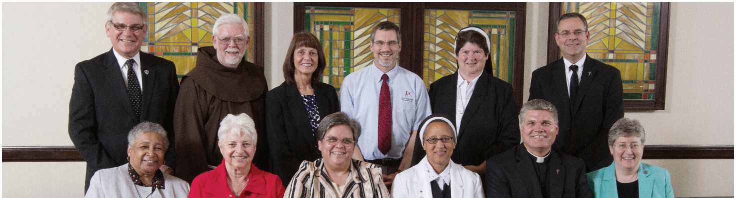
The 2013-14 NRVC Executive Board