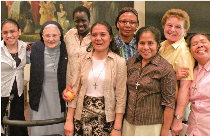
Holy Spirit Missionary Sisters on the day they used the NRVC's Keys to the Future program.

Although the “Keys to the Future” project was launched in June 2012, religious institutes continue to utilize this unique program designed to help communities review where they are with new vocations and to find constructive ways to make progress. The project’s final report, which includes a summary of how congregations have used the “Keys to the Future” program as well as evaluations of the program, may be found at www.nrvc.net .