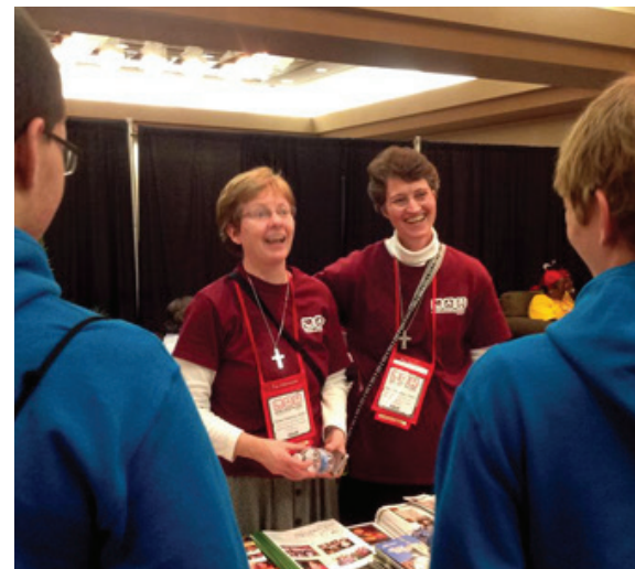
Catholic teens had a chance to meet with more than 200 vocation ministers and members of religious communities who attended the National Catholic Youth Conference (NCYC) in Indianapolis Nov. 20-23, 2013.

Little Brothers of the Good Shepherd Momence, IL