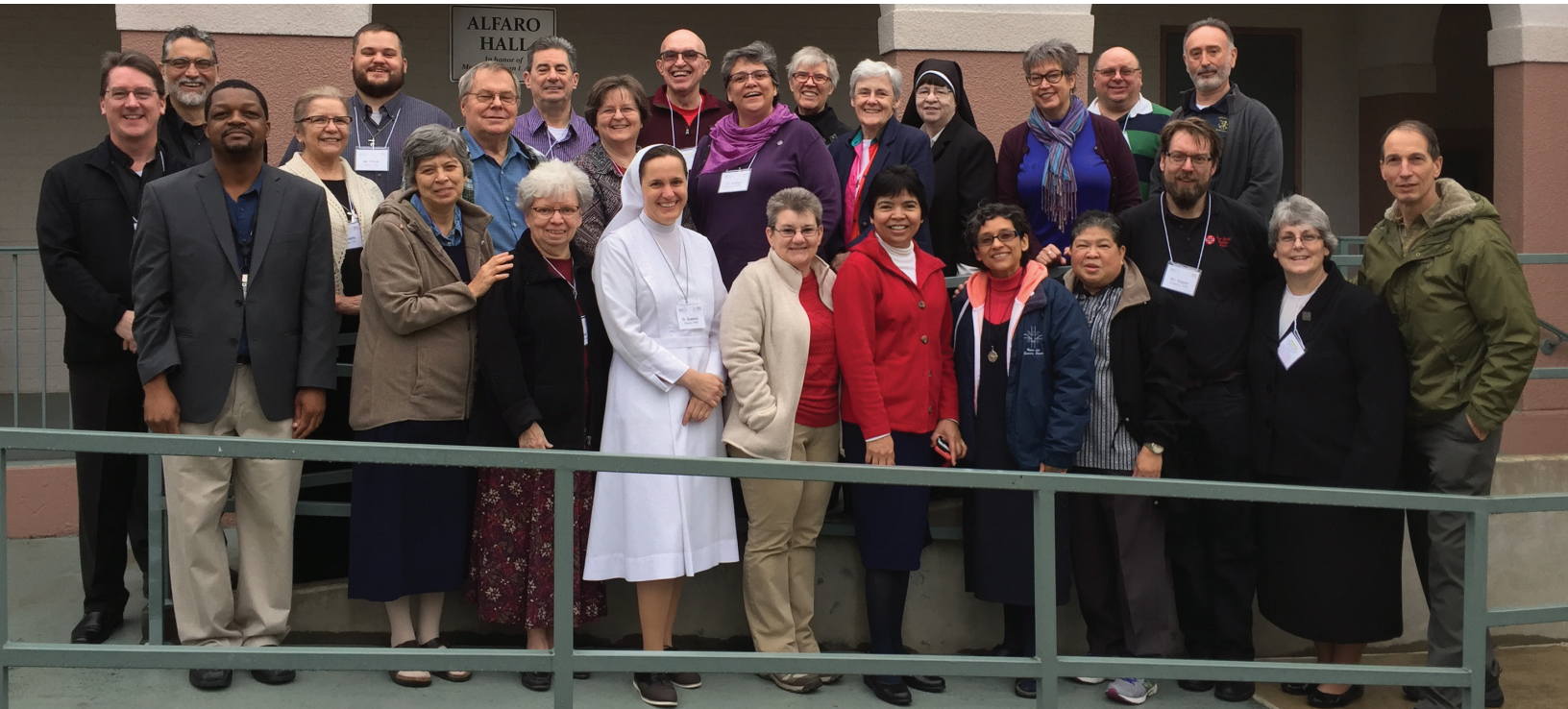
Participants at the Roots of Racism Workshop held at the Mexican American Catholic College in San Antonio, February 2018.