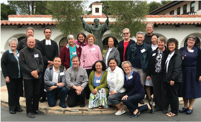
West Coast Member Area Members.