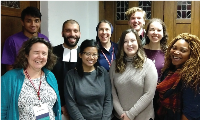
Above, emcees and participants at NRVC's youth-infused event, "You Talk. We'll Listen," held at Canisius College, Nov. 3, 2018. Below, NRVC members snap a selfie at Convocation.