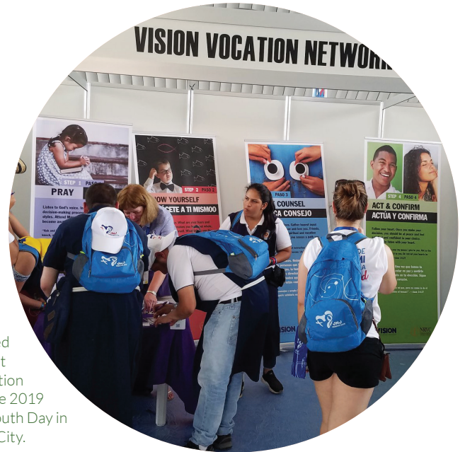
The NRVC's VISION Vocation Network sponsored a booth at the Vocation Fair at the 2019 World Youth Day in Panama City.