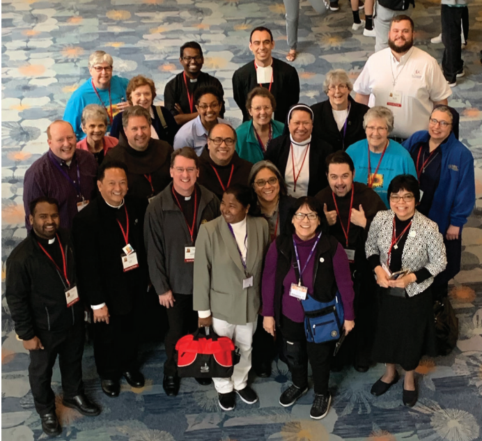
Some of the NRVC members, board, and staff in attendance at the 2019 LA Religious Education Congress.