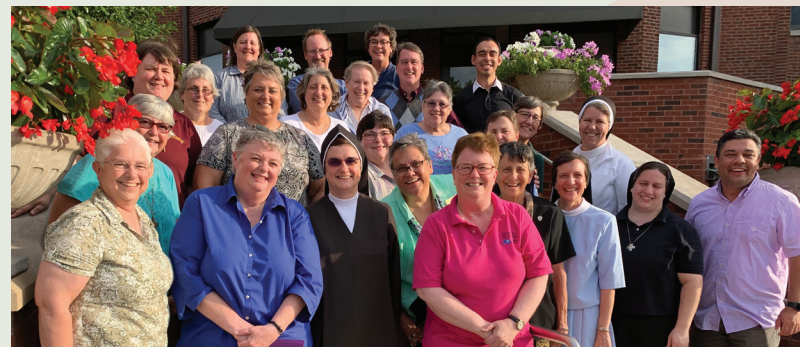
NRVC Member Area Coordinators gathered in Chicago in September 2019.

National Association of Vocation/Formation Directors of Canada Office of Vocations, Bishops' Conference of England and Wales Vocations Ireland